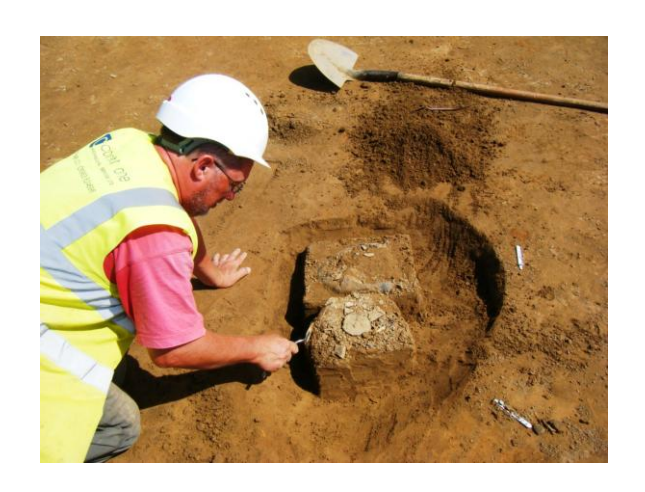
Starting: 3pm 6th November

Stories of the first London, a (male) princess, a look under the 'wobbly bridge', pots of treasure, facing 'death' & much more